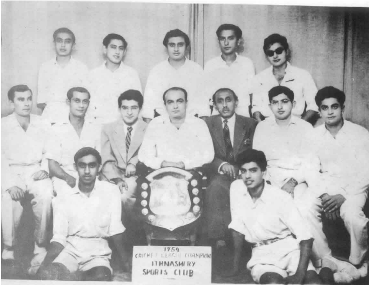
First Ever League Championship - 1954

Historically the club's inception got underway in 1933 when a cricket team was formed. The outbreak of second World War restricted activities but the formation of its first volleyball team under the captaincy of FHR revived activities of the club.